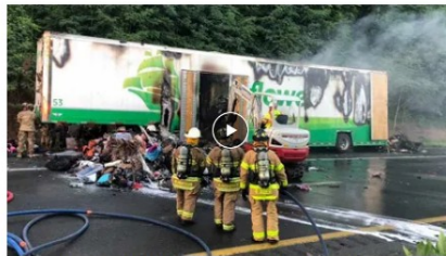
Fundraiser Helping Family that Lost Everything in Albemarle Co. Fire