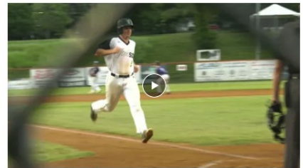
Monday's Valley Baseball League Scores & Highlights