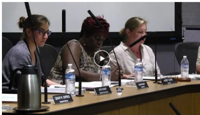
CHRA Board of Commissioners Looking to Improve Conditions Within City